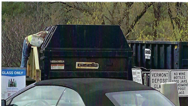
One of our transfer station employees pulls misplaced items out of the glass container. Leaving it there would contaminate the waste stream and cut our revenues!

A: If the load is contaminated with other material like window glass, the town is then charged a higher fee. The town loses money when deposit bottles are thrown in the recycling container. Employees waste time removing the "wrong" glass from the containers.