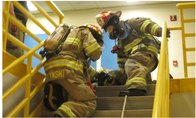
Members practice moving a downed firefighter

FAST squad training was on recognizing symptoms and treating patients that are under the influence of illicit/"street" drugs. Fire training was on extrication and suppression of fires at incidents involving hybrid vehicles and lifting, carrying and dragging fire victims to safety.