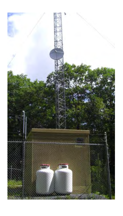
Hurricane Hill Town of Hartford Tower