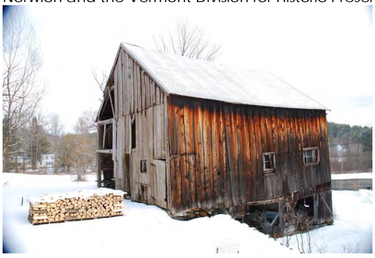
Figure 4 Goodrich Four Corners

1.7.1 BKR shall make any revisions to the HSSS forms suggested by the Town of Norwich and the Vermont Division for Historic Preservation.