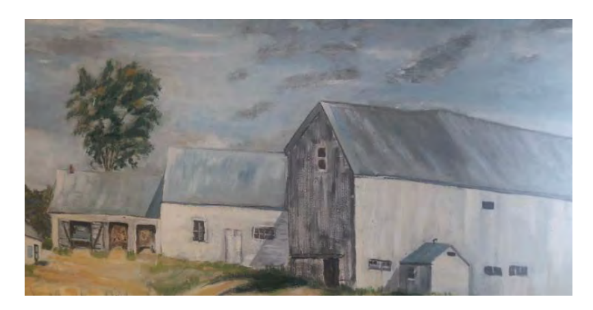
Figure 3 Meeting House Farm