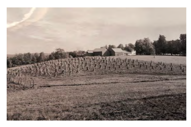
Figure 2 Maple Hill Farm